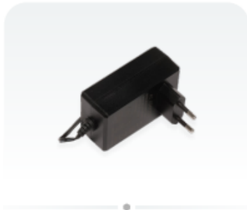
48 V 0.95 A power adapter