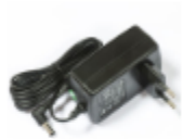
24V 1.2A power adapter

Please visit wiki pages for MikroTik SFP module compatibility table: https://wiki.mikrotik.com/wiki/MikroTik_SFP_module_compatibility_table