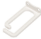
Cable management brackets