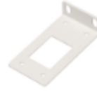
Rackmount ears (CRS354)

Please visit the wiki pages for the MikroTik SFP module compatibility table: https://wiki.mikrotik.com/wiki/MikroTik_SFP_module_compatibility_table