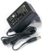
24V 0.8A power adapter