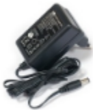
24V 0.8A power adapter