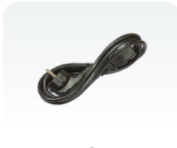
2 Power cords

Package includes the following accessories that come with the device: