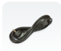
2 Power cords

The package includes the following accessories that come with the device: