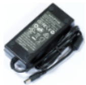
24V 2.5A power adapter

The package includes the following accessories that come with the device: