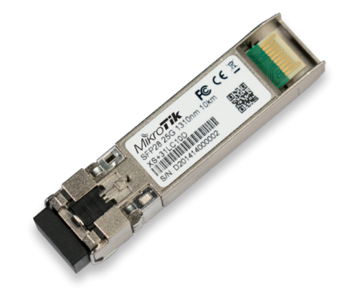
Units are compatible with non-MikroTik SFP devices as well.