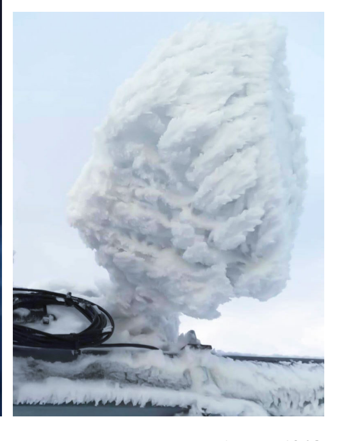
No heating? No problem! We test most of our equipment at temperatures as low as -40 ^{\circ} C.