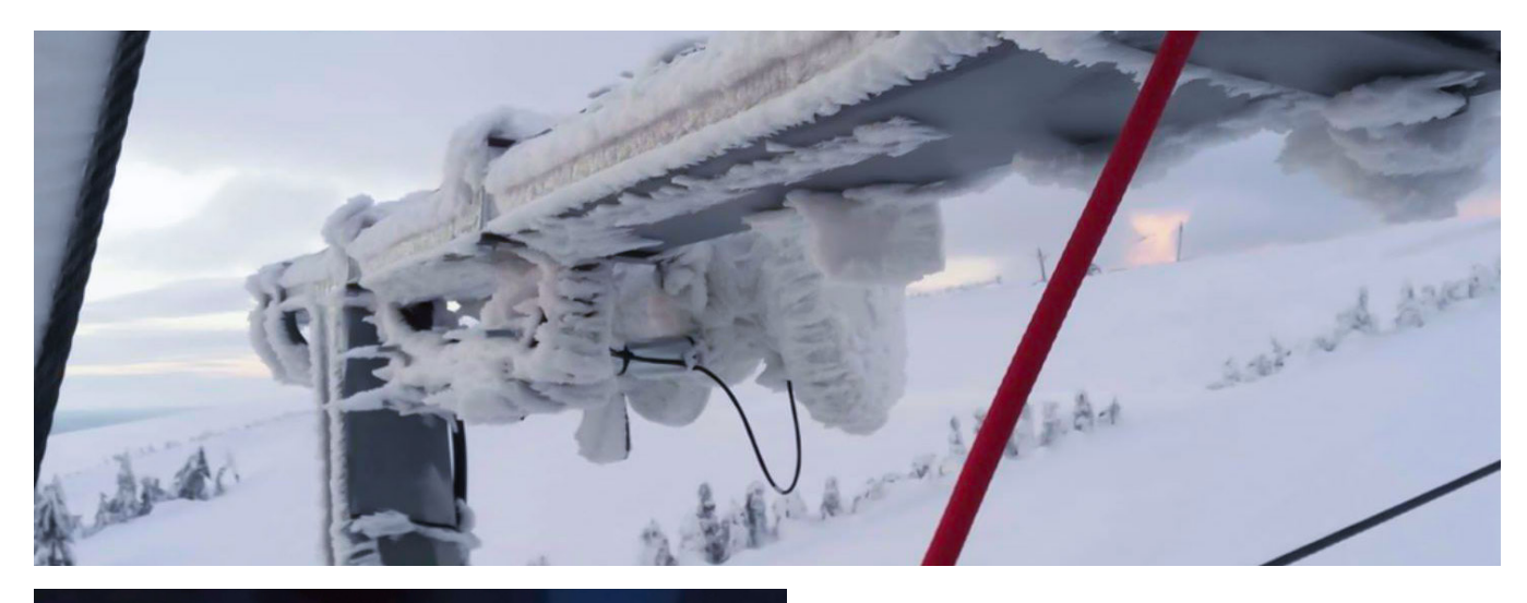
Photos of MikroTik devices on the Czech side of the Ore Mountain Range provided by IPMedia network.

"What good is the warmth of summer, without the cold of winter to give it sweetness."